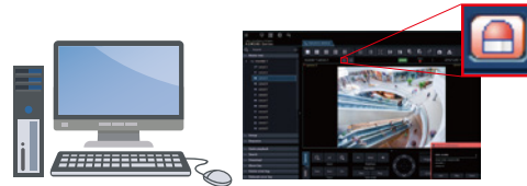
Notification sent to the monitoring screen

i-VMD is possible to detect objects in the specified area by advanced video analysis technology. i-VMD : Intruder Detection, Loitering Detection, Direction Detection, Scene Change Detection, Object Detection, Cross Line Detection